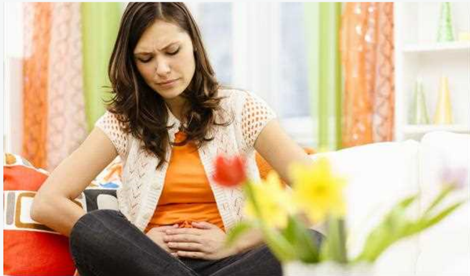
Ibs,Ibs Symptoms,Irritable Bowel Syndrome,Diarrhea,Constipation,Nausea

Also known as redundant colon, here, the colon is longer than it is expected to be. Sometimes, due to the enlarged size, the sigmoid colon tends to twist and causes blockages resulting in pain.